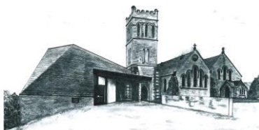
Christ Church Corner Koroit & Henna Streets