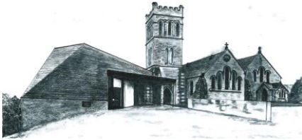
Christ Church Corner Koroit & Henna Streets

✠ Celebrating the love of God for all people & Serving our Community ✠