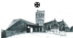
Christ Church Corner Korvit & Henna Streets