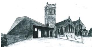
Christ Church Corner Koroit & Henna Streets