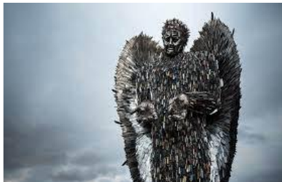
The Knife Angel

National Monument Against Violence & Aggression - Coventry